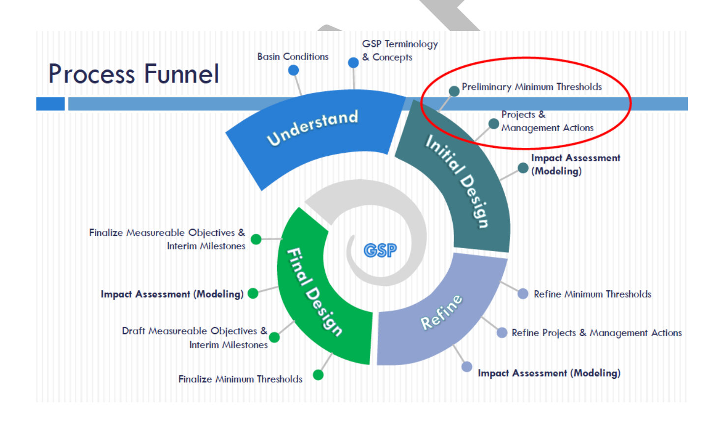
Figure 2. Example of GSP Development Process from Salinas Valley Technical Advisory Committee (TAC).